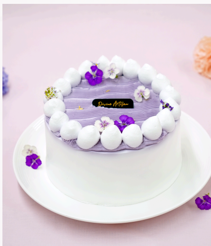
BLACK SESAME ORH NEE CAKE (6")