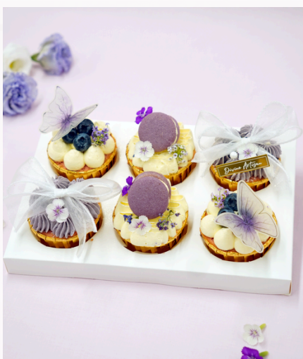
BLOOMING LOVE CUPCAKE BOX