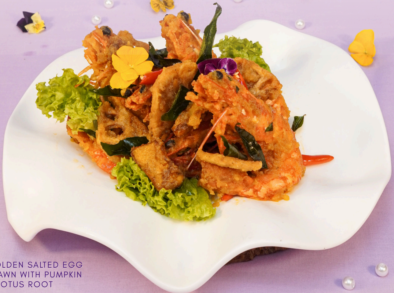
GOLDEN SALTED EGG PRAWN WITH PUMPKIN & LOTUS ROOT

Photos are meant for illustration purposes only.