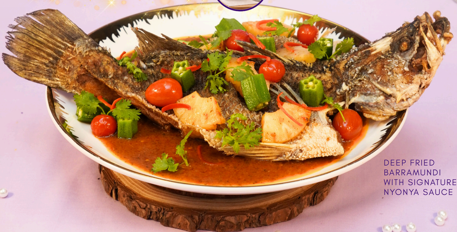
DEEP FRIED BARRAMUNDI WITH SIGNATURE NYONYA SAUCE

Photos are meant for illustration purposes only.