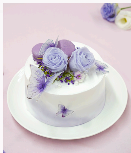
BLOOMING LOVE CAKE (6")