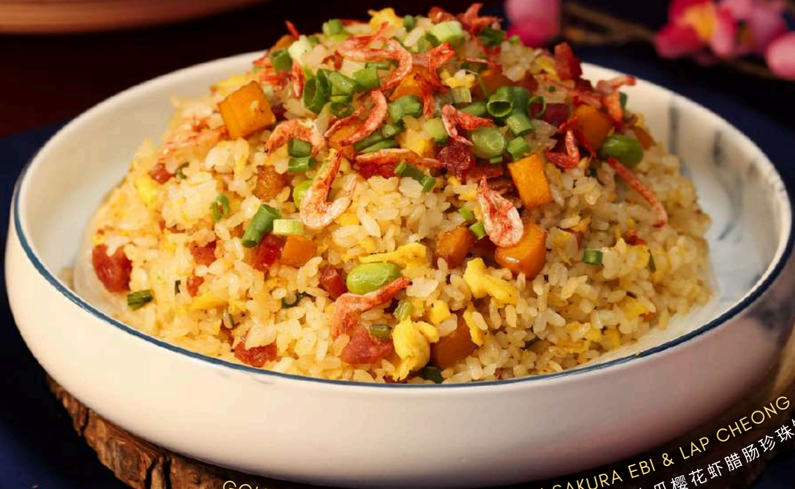
GOLDEN PUMPKIN PEARL RICE WITH SAKURA EBI & LAP CHEONG 金瓜櫻花蝦腊肠珍珠饭

CHILLED SNOW FUNGUS WITH PEAR 桂花雪耳炖雪梨 (阖家幸福)