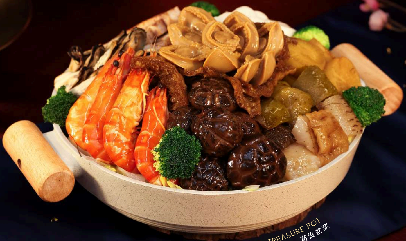
EMPEROR'S TREASURE POT 富贵盆菜

OR CHILLED POMELO MANGO SAGO WITH LYCHEE POP 冰镇杨枝甘露·荔枝爆珠 (好运连连)