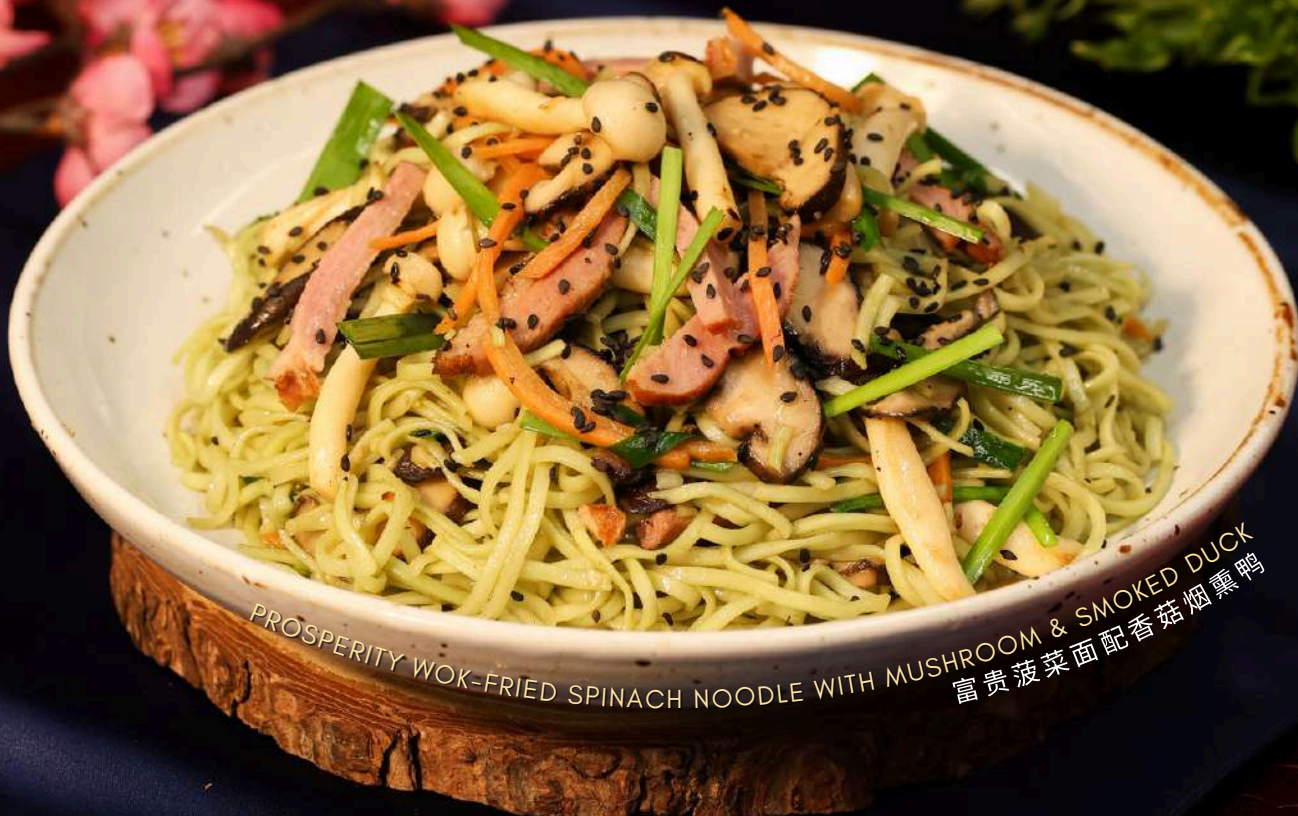
PROSPERITY WOK-FRIED SPINACH NOODLE WITH MUSHROOM & SMOKED DUCK 富贵菠菜面配香菇烟熏鸭

CHILLED SNOW FUNGUS WITH PEAR 桂花雪耳炖雪梨 (阖家幸福)