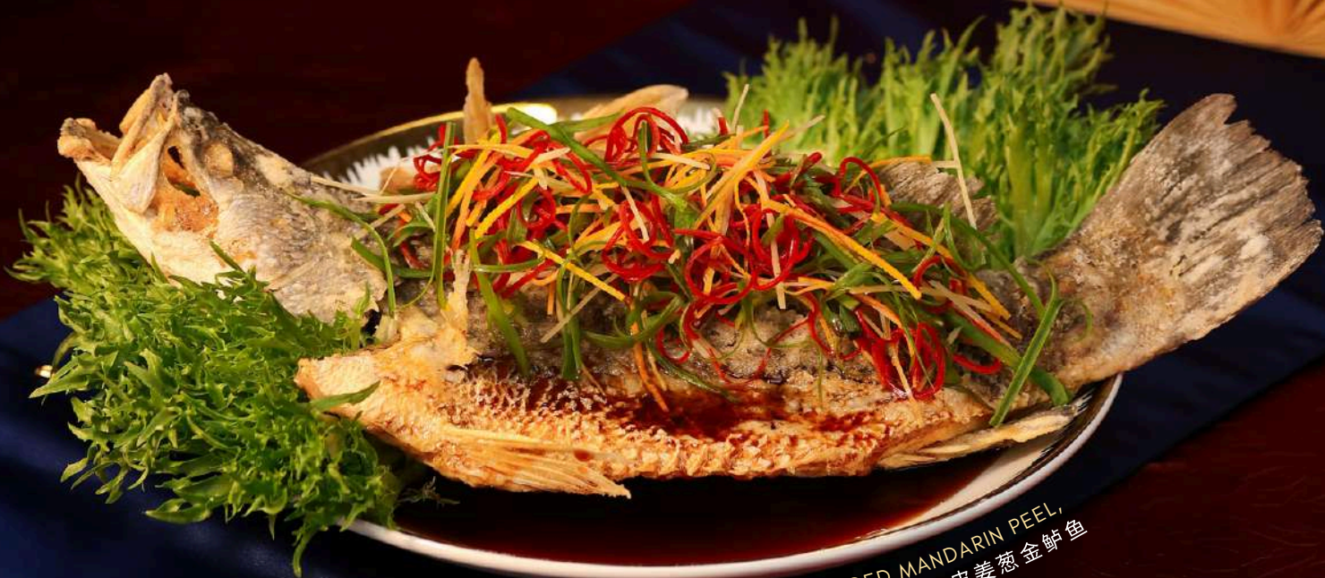
WHOLE FRIED BARRAMUNDI WITH AGED MANDARIN PEEL, SUPERIOR SOY & GINGER 陈皮姜葱金鲈鱼

*Photos are for illustration purposes only.