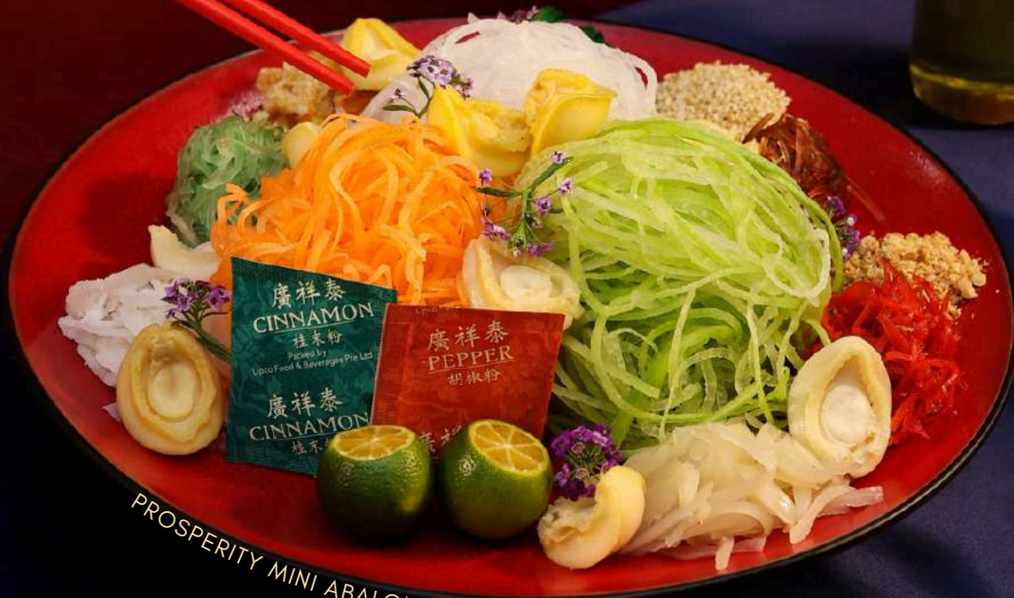
PROSPERITY MINI ABALONE YU SHENG 鸿运鲍鱼生

*Photos are for illustration purposes only.