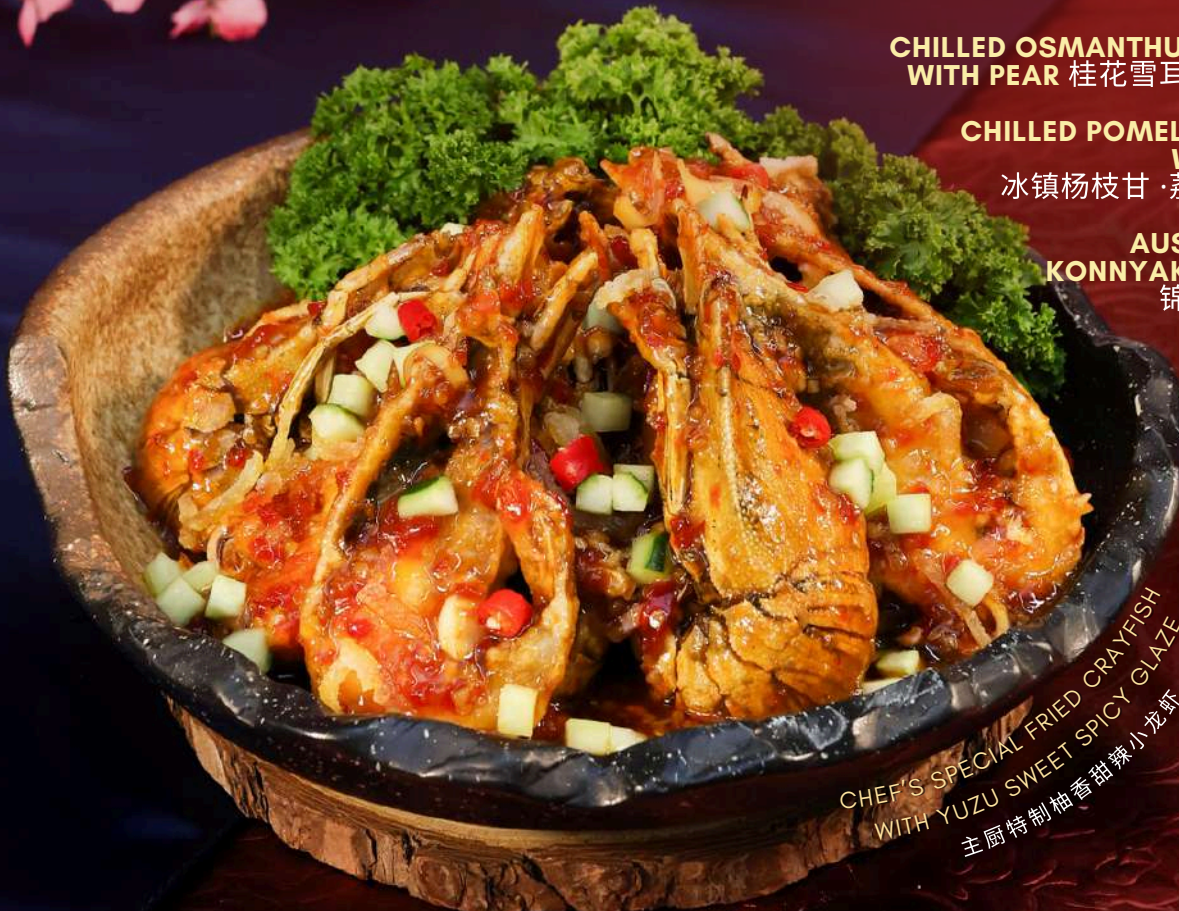
CHEF'S SPECIAL FRIED CRAYFISH WITH YUZU SWEET SPICY GLAZE 主厨特制柚香甜辣小龙虾

*Photos are for illustration purposes only.