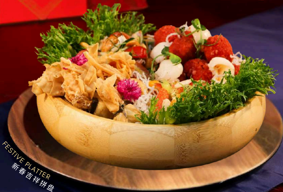
FESTIVE PLATTER 新春吉祥拼盘

*Photos are for illustration purposes only.