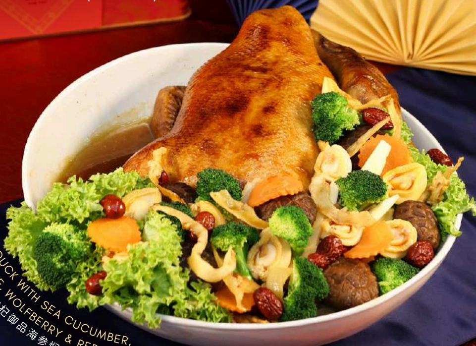
BRAISED DUCK WITH SEA CUCUMBER, SHITTAKE, WOLFBERRY & RED DATE 红枣枸杞御品海参焖鸭

SPRING SEASON'S VEGETABLES WITH BABY ABALONE 春季时蔬配小鲍鱼 (四季平安) Thai Asparagus, Lotus Roots, Carrots, Macadamia, Sweet Peas, Black Fungus, Water Chestnuts, Baby Abalone