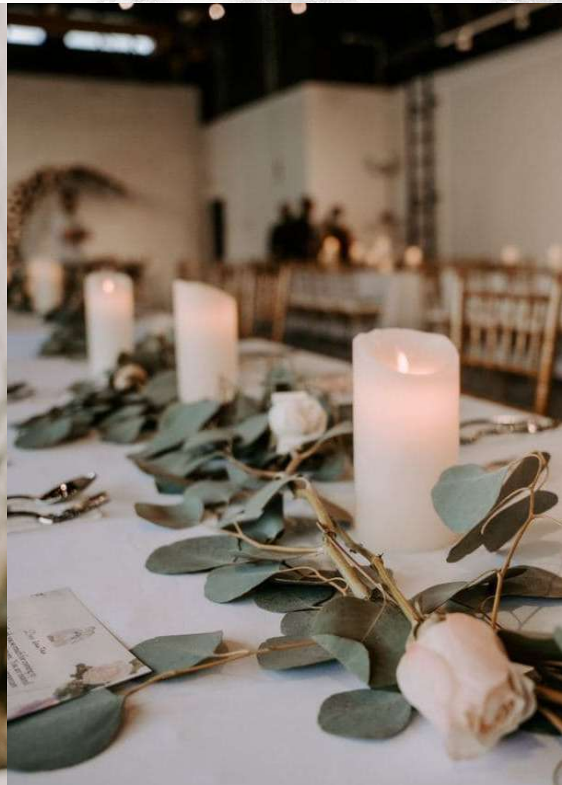
Garland Table Centrepiece