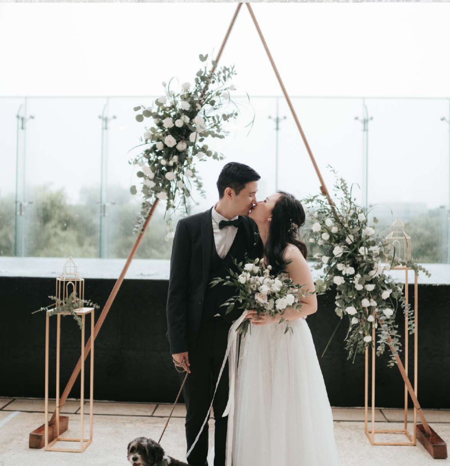
'Rustic Botanical' wedding arch