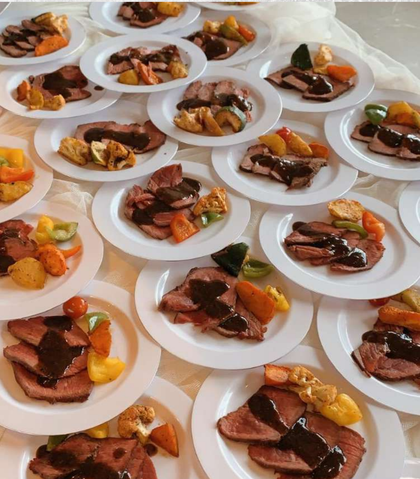
Sous Vide Beef Striploin