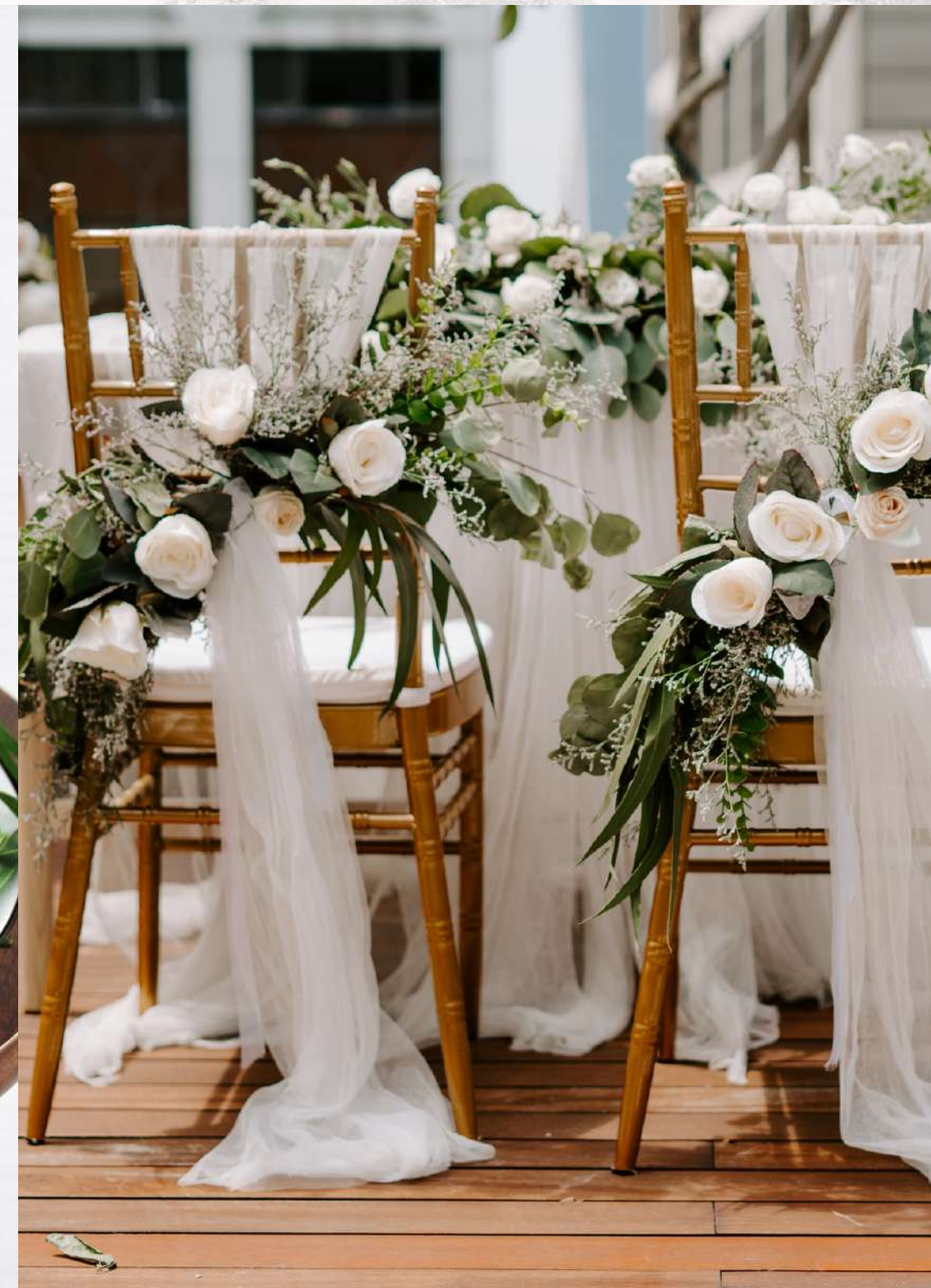
Bride & Groom Chair Posies