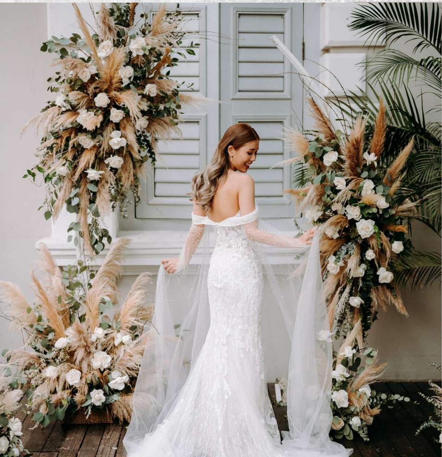
'The Ivory Hill' wedding arch