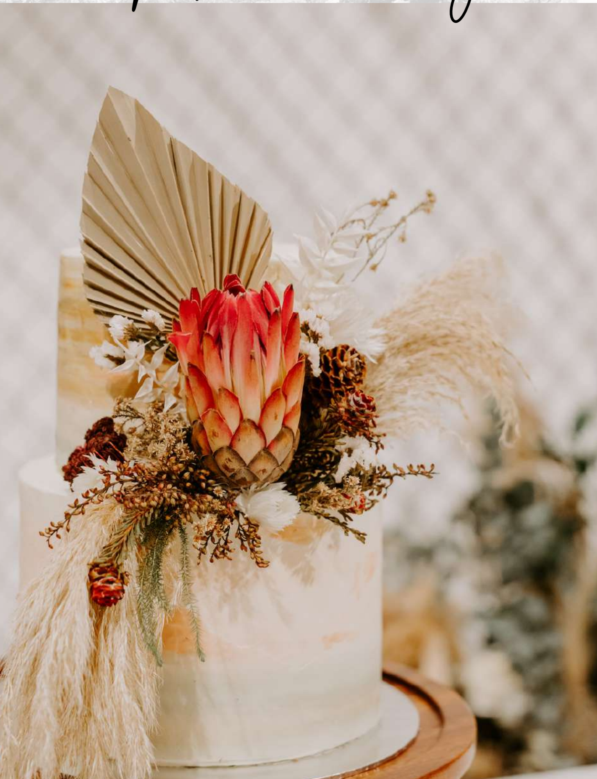
One-tier wedding cake *illustration shows two-tier cake