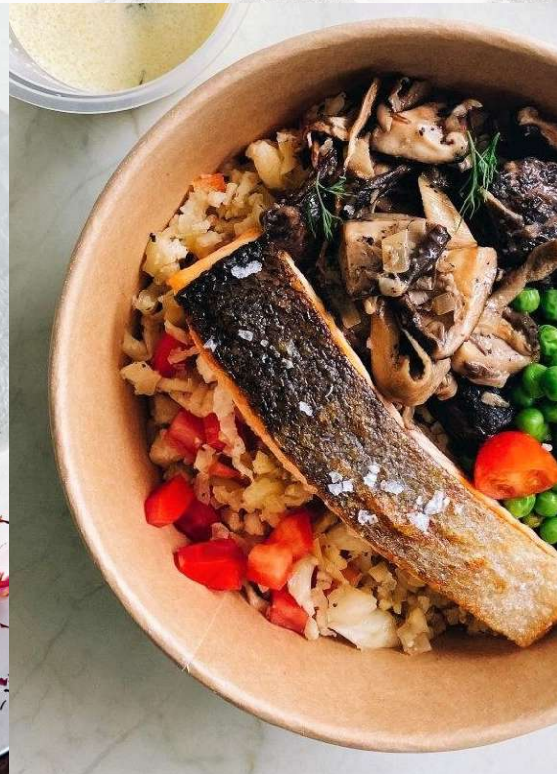
Wedding Grain Bowl