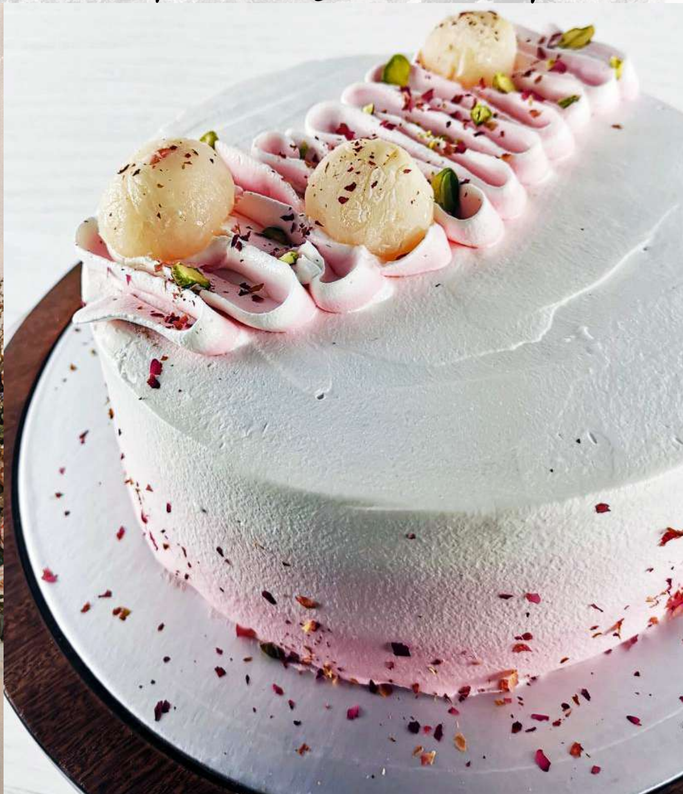
Lychee Rose with Pistachio Cake