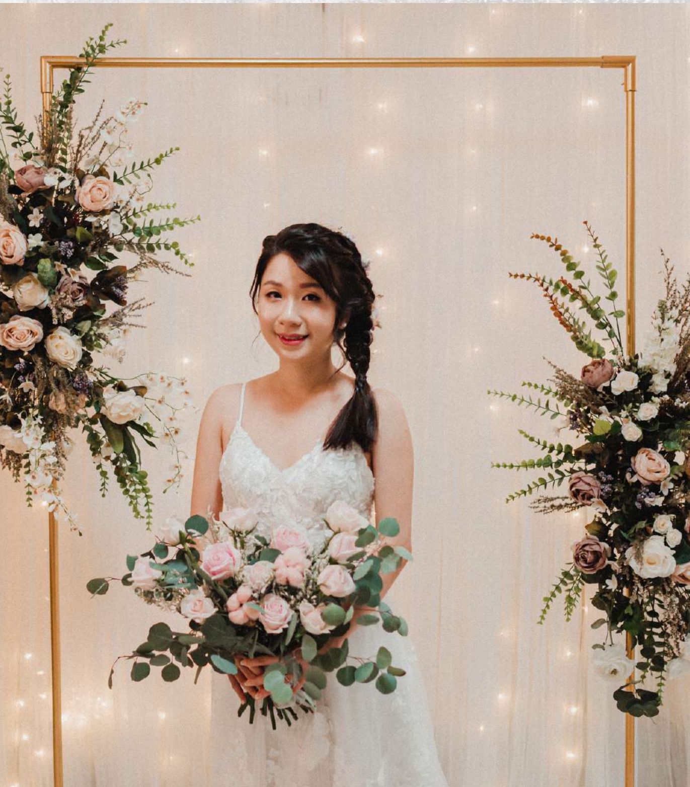
Starlet O'hara wedding arch